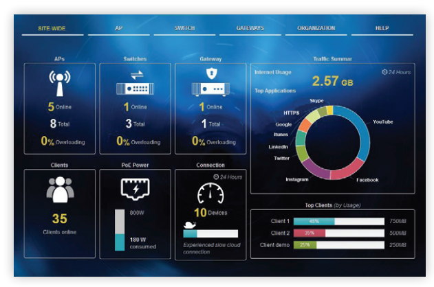
Real-time control of all the devices through a single pane of glass

The Zyxel Nebula NAP102 is a 2x2 802.11ac AP that provides Gigabit Wi-Fi experience. The concurrent dual-band support meets the pervasive BYOD demands to support more clients with equal signal coverage in both 2.4 GHz and 5 GHz bands.